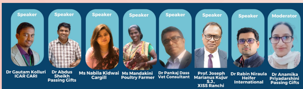
XISS celebrates World Egg Day 2025 with webinar on Rural Poultry Enterprises

Topic of the Webinar was "Hatching Hope: Rural Poultry Enterprise for Nutrition, Income and Women's Agency".