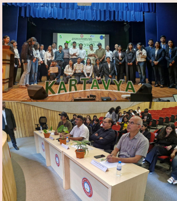
Four students participated in Kartavya '25, a CSR-based idea competition organized by BIT Mesra

https://xiss.ac.in/news/four-students-participated-in-kartavya-25-a-csr-based-idea-competition-organized-by-bit-mesra