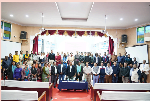
XISS conducts awareness workshop on Prevention of Sexual Harassment of Women at Workplace