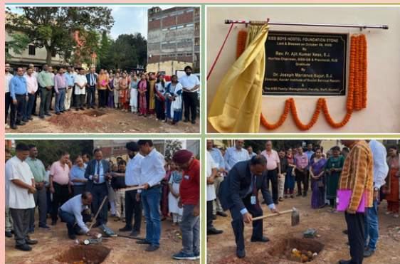
Blessing Ceremony and Foundation Stone laying of XISS's Boy's Hostel

https://xiss.ac.in/news/xiss-conferred-as-top-performing-ndli-club-in-jharkhand-by-ndli-at-iit-kharagpur