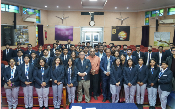
IEM, Kolkata students educational visit to XISS, Ranchi