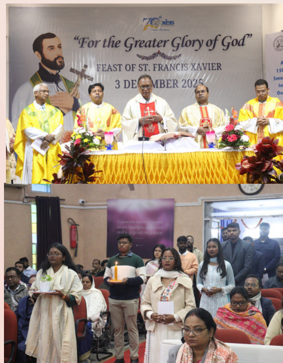
Feast of St Francis Xavier celebrated at XISS