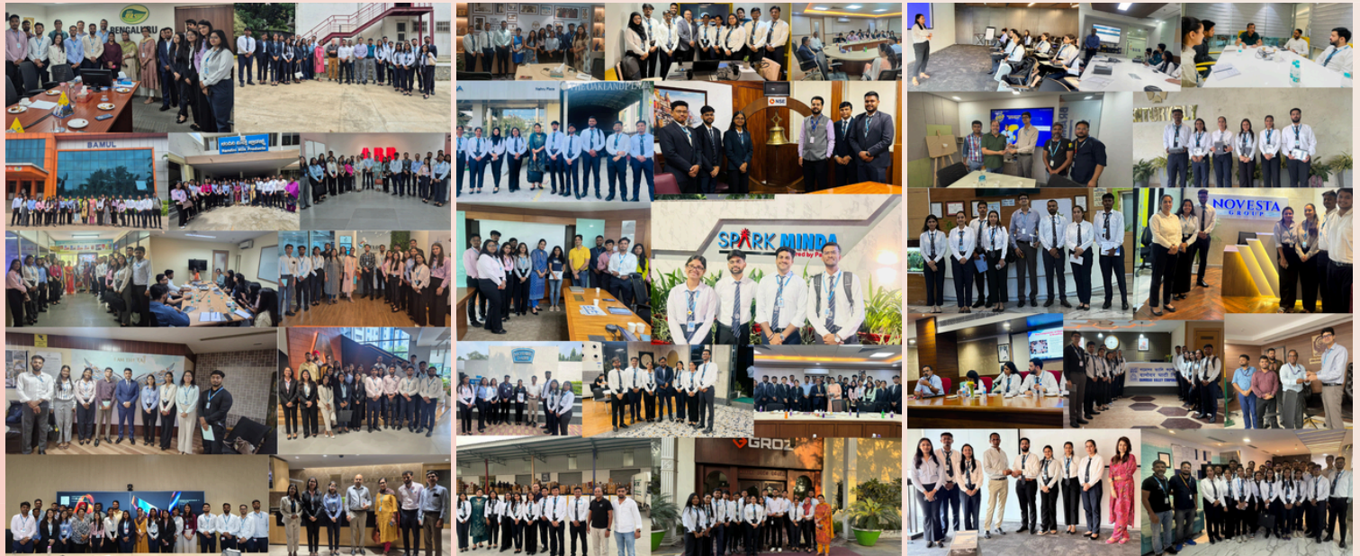
Second-Year Marketing Management students gain exposure during Industrial Visit to diverse organizations

In Delhi, students visited several reputed organizations including Captain Tractors, Peesafe, Hindware, MaSuzuki, Groz Tools, Hero MotoCorp, Mother Dairy, Max Life, Bacardi, NSE, Uflex, Whirlpool, Spark Minda, McDermott, Schneider, STT Global & CBRE, and Dabur. The visits provided them with exposure to varied sectors such as automobiles, consumer goods, insurance, beverages, logistics, and capital markets.