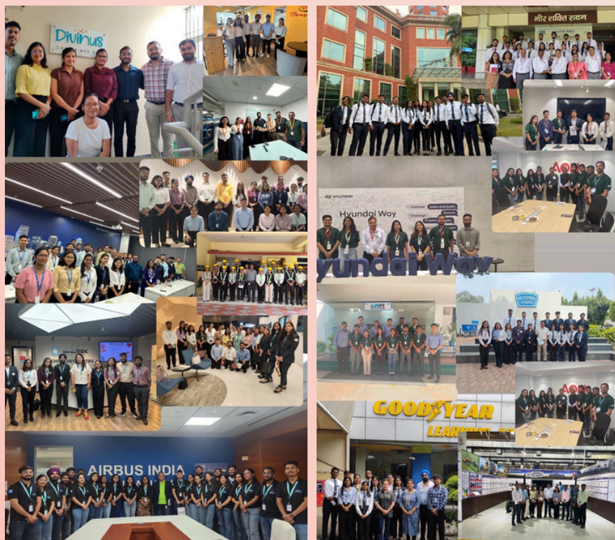
Human Resource Management Students of 2024-26 Batch acquire key insights during Industrial Visit

Students gain hands-on exposure to contemporary industry and corporate practices.