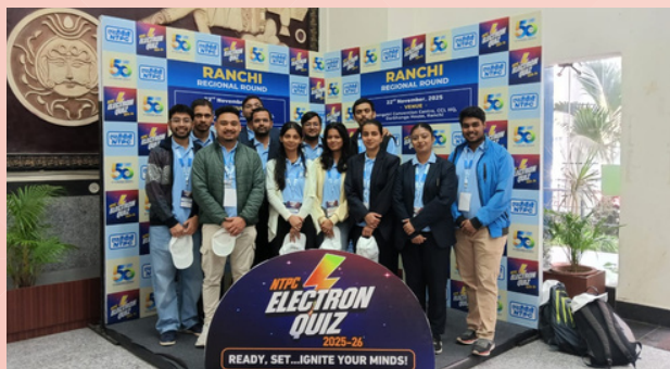
XISS Ranchi shines at NTPC Electron Quiz 2025 with dual Top-6 Finish

https://xiss.ac.in/news/ranchi-makes-a-powerful-impact-at-ensemble-valhalla-2025