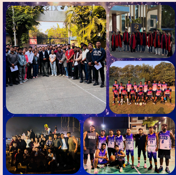
XISS Ranchi makes a powerful impact at Ensemble-Valhalla 2025