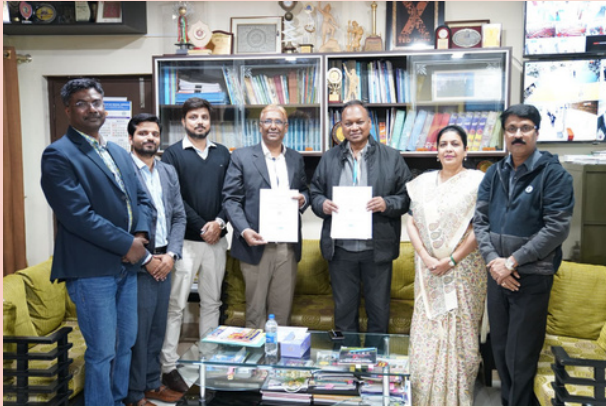
XISS organised Leadership Talk by National Payments Corporation of India (NPCI)

XISS, Ranchi, and Regional Capacity Building & Knowledge Institute (RCB&KI), Ranchi, Indian Audit and Accounts Department, (Government of India) signed a Memorandum of Understanding (MoU) for three years on the campus on 27 November 2025. The objective of this MoU is to establish a healthy framework for co-operative institutional relations to encourage and promote co-operation in capacity building of the Govt. officers and faculty/staff/students of XISS.