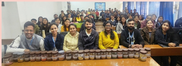
RM students create a Seed Museum

https://xiss.ac.in/news/56-students-receive-pgcm-gis-certificates-during-award-ceremony