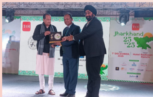
XISS awarded Best Institution contributing to the development of Jharkhand by The Times of India