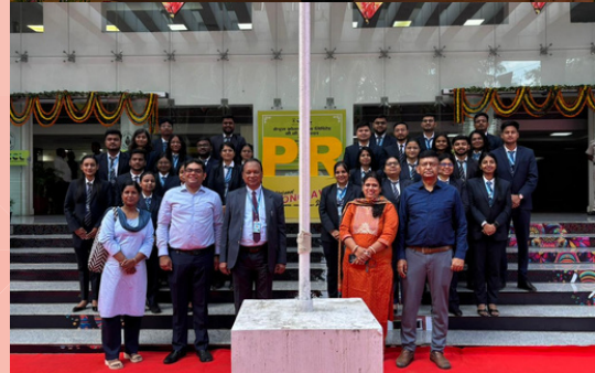
XISS Ranchi participates in National PR Conclave hosted by Central Coalfields Limited

Representatives and students of XISS, Ranchi, participated in the National Public Relations Conclave on the theme "Redefining PR: From Information to Engagement in the Era of Digitalization," organized by Central Coalfields Limited (CCL) at Ranchi from 8–9 October 2025.