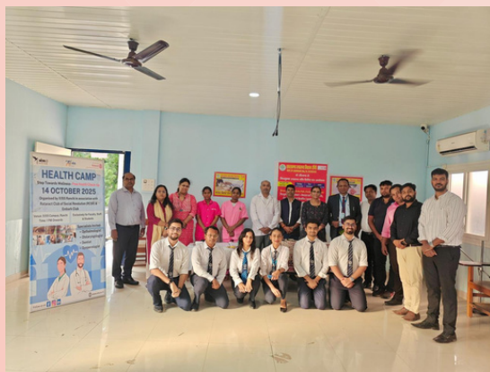
XISS, Ranchi organized a free health check-up camp in collaboration with Jharkhand Health Mission