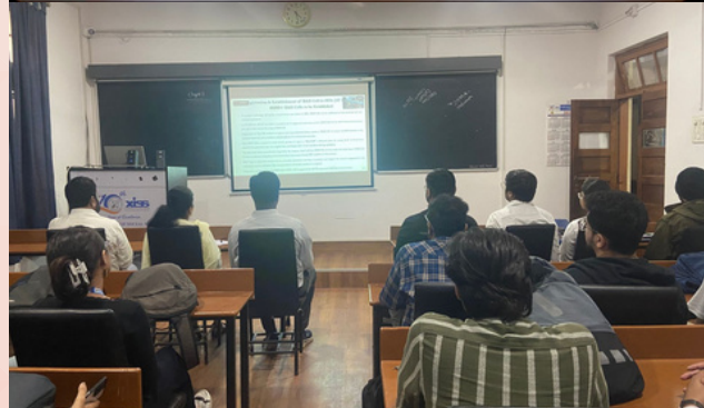
CIINEX participated in an orientation Session on IIC R&D Cell Activities