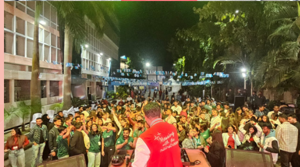
"Maxfest 4.0" organised by MarkBuzz at XISS

XISS, Ranchi, hosted the 4th edition of its Inter B-School Fest – "MAXFEST 4.0", organized by the Marketing Management Programme and its marketing club, Markbuzz, on 8 November 2025, at the XISS campus.