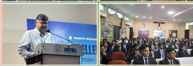
Maruti Suzuki India Limited organised LeadXcellence 3.0