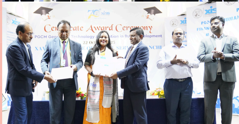
56 students receive PGCM-GIS Certificates during award ceremony

XISS, Ranchi, organised the Certificate Award Ceremony for its Post Graduate Certificate in Management – Geospatial Technology Applications in Rural Development (PGCM-GIS), an AICTE-approved programme, for the 2023-24 and 2024-25 batches on 22 October 2025.