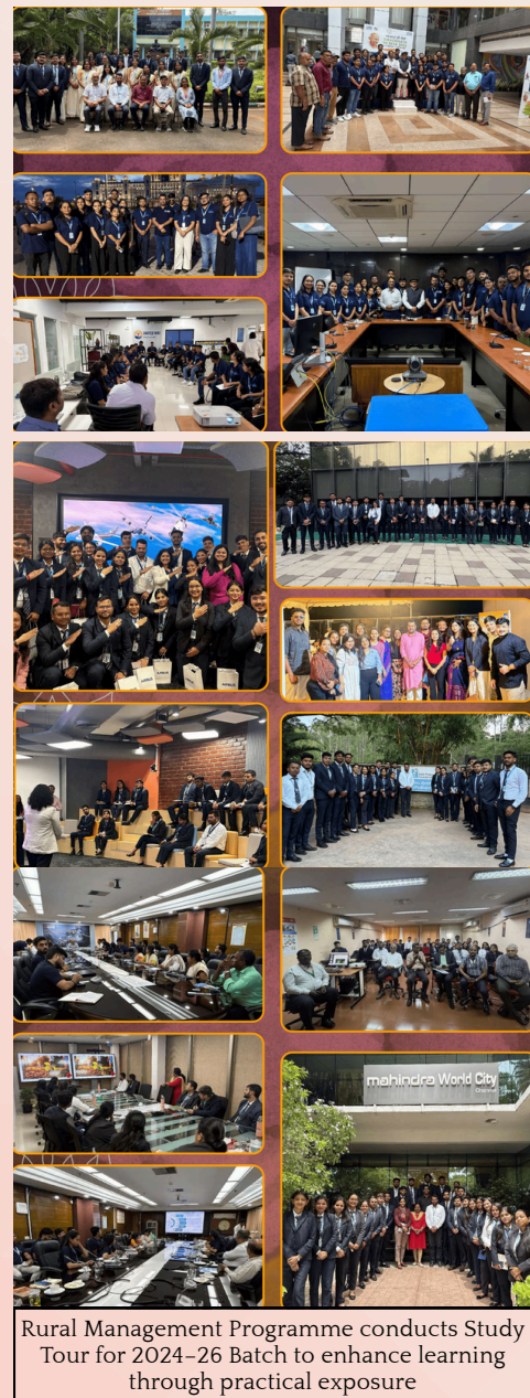
Rural Management Programme conducts Study Tour for 2024-26 Batch to enhance learning through practical exposure

In Delhi, students visited several reputed organizations including Captain Tractors, Peesafe, Hindware, MaSuzuki, Groz Tools, Hero MotoCorp, Mother Dairy, Max Life, Bacardi, NSE, Uflex, Whirlpool, Spark Minda, McDermott, Schneider, STT Global & CBRE, and Dabur. The visits provided them with exposure to varied sectors such as automobiles, consumer goods, insurance, beverages, logistics, and capital markets.