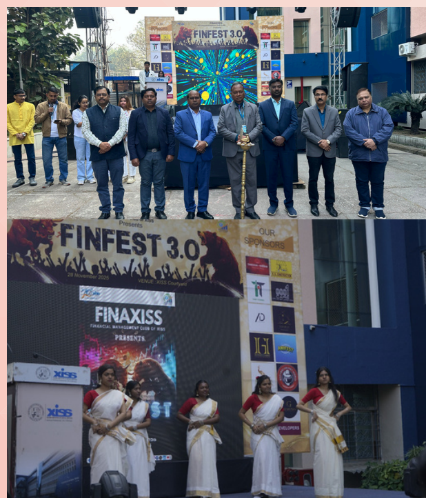
Inter B-School Fest "FINFEST 3.0" organised by FINAXISS

Director, XISS, congratulated the organisers for the successful execution of FINFEST 3.0 and lauded the efforts of students, faculty, and coordinators. He remarked by saying that Finance is the language of business, built on leadership, decision-making, and responsible risk-taking. This event is a