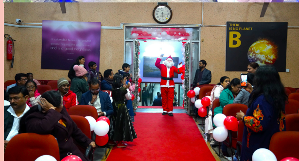
XISS Ranchi celebrates Christmas with joy, fellowship, and shared values

On 19 December 2025, XISS, Ranchi celebrated a heartwarming Christmas Gathering, bringing together faculty, staff and their families in an atmosphere filled with joy, gratitude, and togetherness. The campus was adorned with festive decorations, echoing the spirit of hope and harmony that Christmas represents.