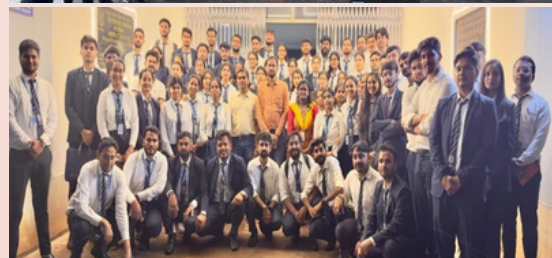
Educational Exposure Visit to ICAR Institutes Enriches Students' Learning Experience