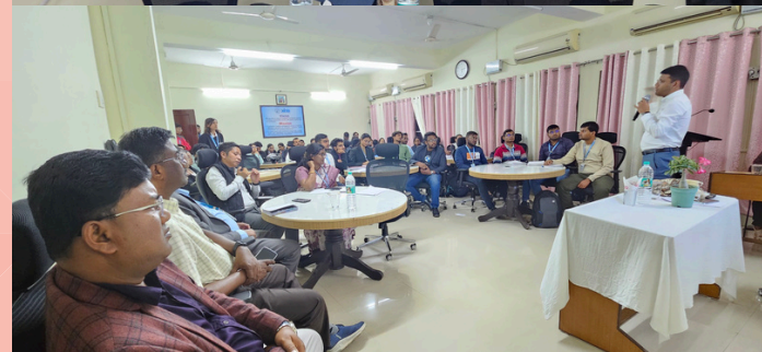
CIINEX & IIC hosted a Talk Session under the Impact Lecture Series