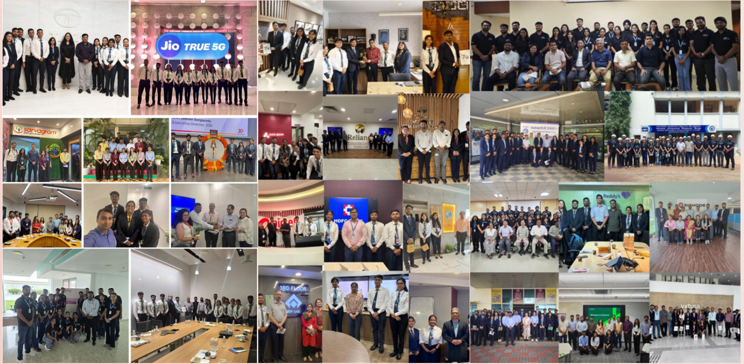
Human Resource Management Students of 2024–26 Batch acquire key insights during Industrial Visit

The Kolkata tour covered a diverse range of companies from manufacturing to finance and energy, allowing students to connect academic learning with industrial realities. Companies visited were Tata Steel Downstream Products Limited (TSDPL), Reliance Jio, Axis Bank, Ambuja Group, BPCLOswal Group, HDFC Bank, Steel Authority of India Limited (SAIL), to name few.