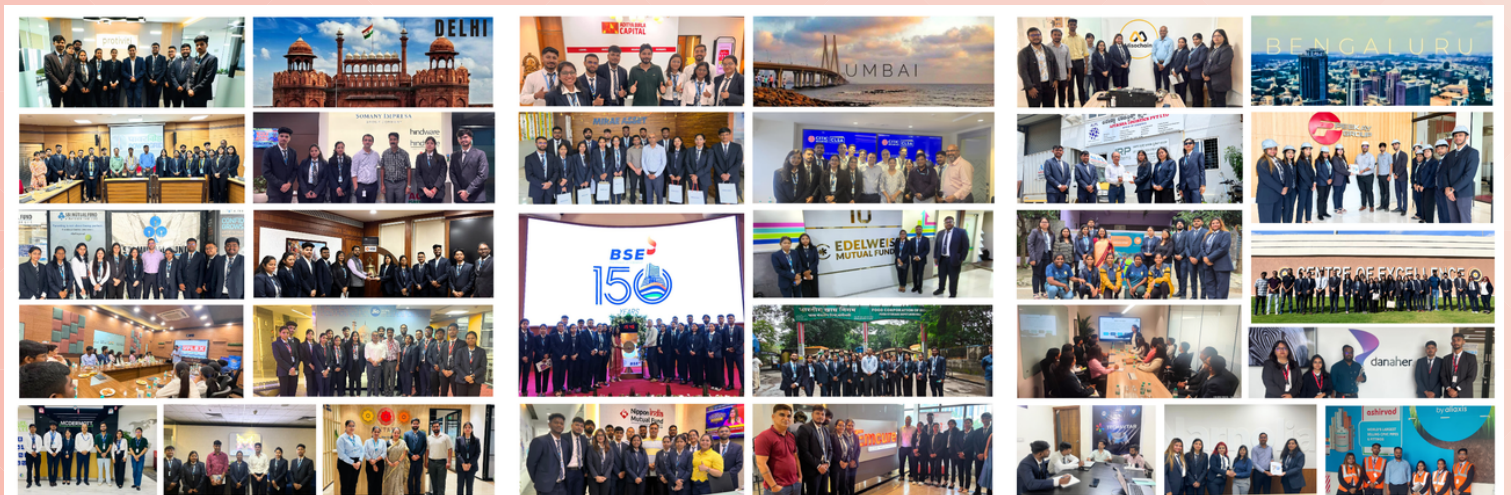
Second-Year Financial Management students undertake Industrial Tour across key industries

Students gain insights into Investment Practices, IPO Processes, Trading, and Corporate Finance Roles.