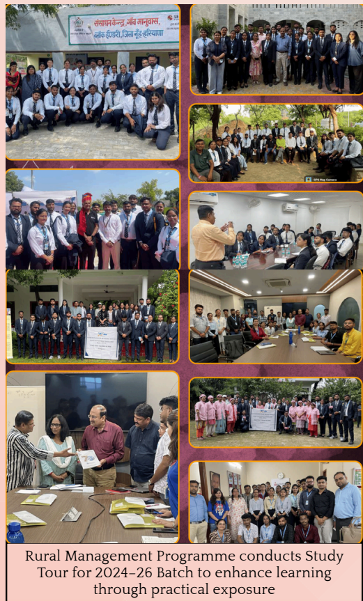
Rural Management Programme conducts Study Tour for 2024-26 Batch to enhance learning through practical exposure

In Delhi, the group engaged with several renowned organizations, beginning with Valvoline Cummins, followed by Synopsys Inc, Spark Minda, Caritas India, Samvedana Development Society, Nestlé International Limited, Prayas, Vishwa Yuvak Kendra, and United Way of Delhi. Each of these reputed institutions offered unique perspectives on development and social change, ranging from corporate social responsibility and sustainable business practices to youth empowerment, social justice, and community-driven initiatives.